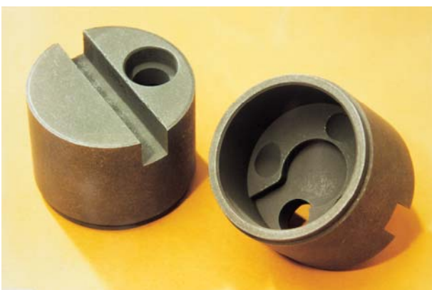
Sintered metal cam housing for the Saab brake caliper. The Sherardizing deposits follow the intricacy of the formed shape exactly.