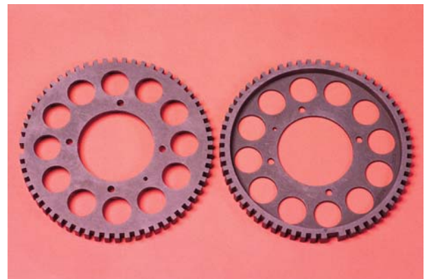
Sintered timing ring for Jaguar cars.